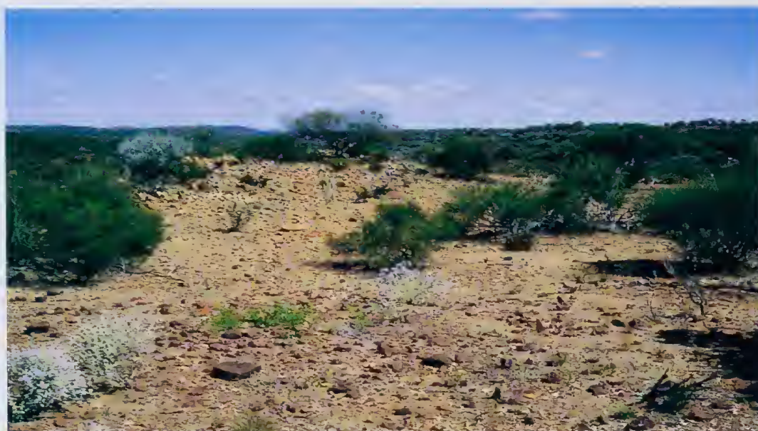
Figure 2. Habitat of A. picturata paratype.